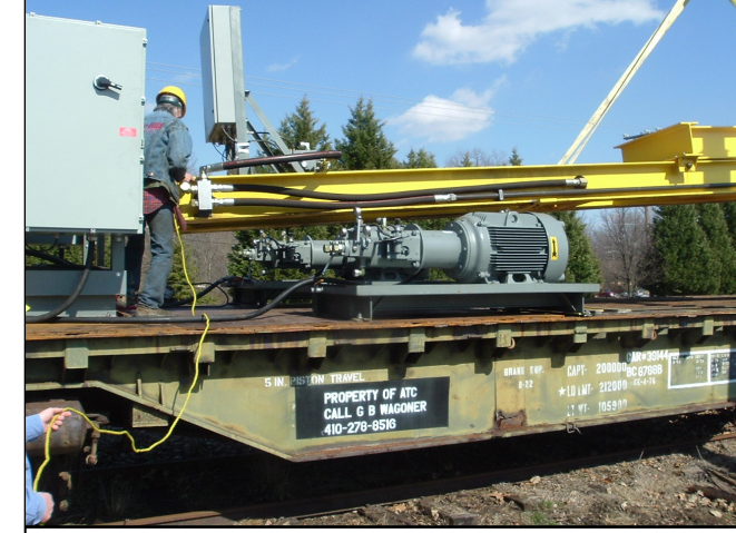
Hydraulic Rail Car Positioner to Test Sliding Ramp Foot/Vehicle Interaction

private industry. Craft's specialty is the practical