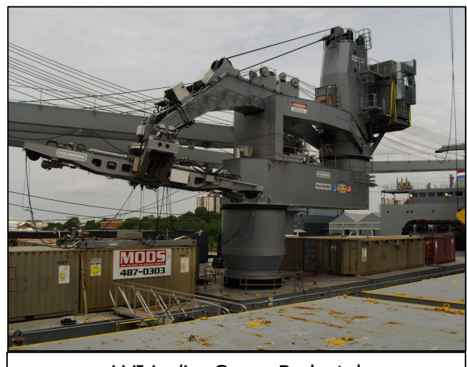
LVI Lo/Lo Crane Pedestal

mechanical, electrical, structural and hydraulic engineering services to the U.S. Government and